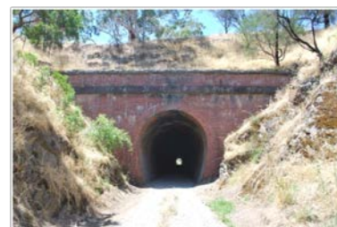
The Great Victorian Rail Trail